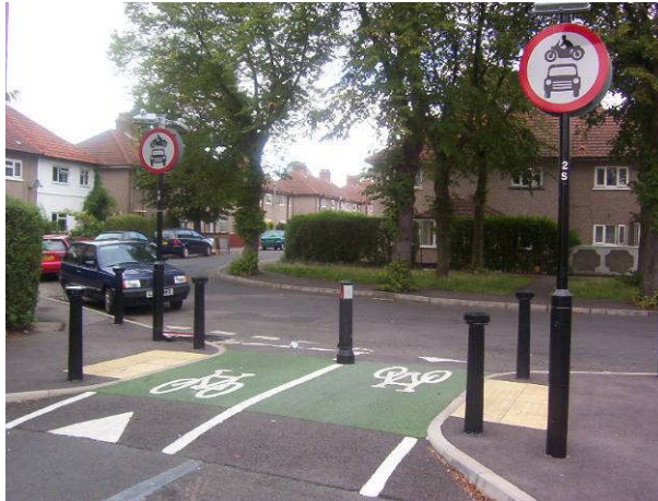
A cycle gap linking two culs-de-sac: Oxford