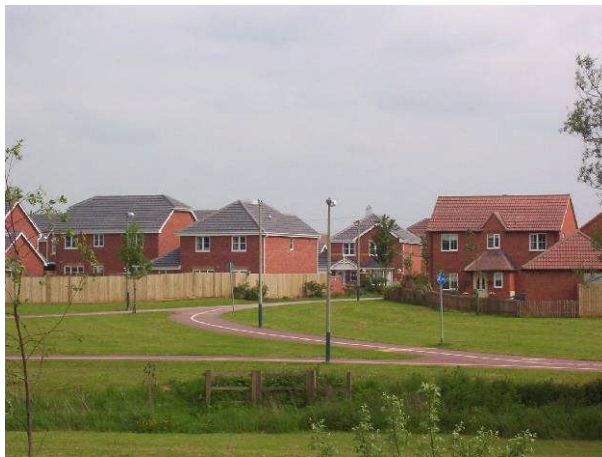
Cycle tracks link a new development directly to shopping and leisure facilities: Wiltshire.

Cyclists should generally be able to travel around and through the site relatively freely. To create this level of permeability, they should generally be able to use all access ways, courts, links between culs-de-sac etc. It is important that cycle links are made as direct as possible. For short trips, these can give cyclists significant advantages over car users in terms of convenience and journey time. When planning any major development, cycle links should be negotiated to connect it to key facilities such as schools, local shops, public transport, and employment areas. Most cycle journeys for non-work purposes and those to rail stations are between 0.5 and 2 miles, but many cyclists are willing to cycle much further. For work, a distance of 5 miles should be assumed.