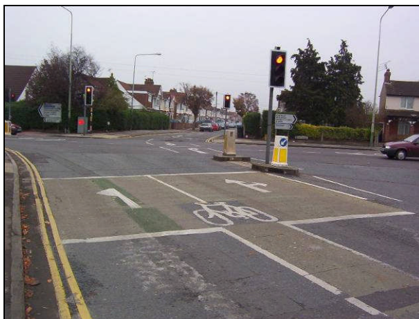
ASL at signals with filter, Swindon

Where there are filter lights for left or right turning traffic, cyclists should be able to safely reach the reservoir when the filter signal is green. Waiting cyclists should not be put in a position where they obstruct traffic moving off on the green filter. One innovative solution has been to create a split cycle reservoir with additional markings to indicate on which side cyclists should wait (see picture below). Adopting such a solution requires special authorisation.