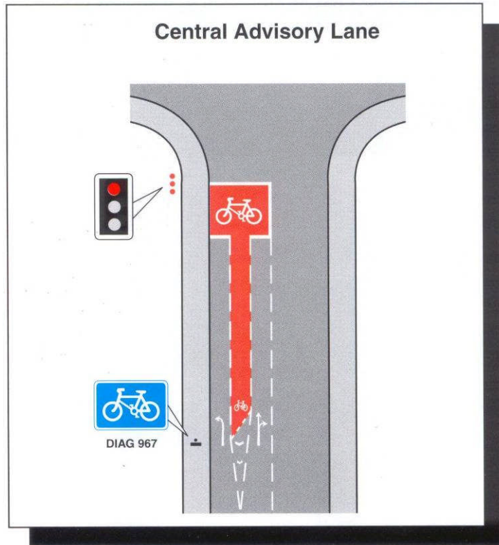
From Traffic Advisory Leaflet TAL 8/93

In determining the best solution the designer needs to consider how difficult it is for cyclists to position themselves correctly at the reservoir (partly dependent on the width and depth of the ASL) against how difficult it is for cyclists to move from the nearside into a central or off-side cycle lane. In cases where there is localised widening or flaring on the approach to the junction from one lane to two lanes, the best option is sometimes for the advisory lane to move from the nearside to the middle of the two vehicle lanes at the point of widening, so that motorists moving into the left lane have to cross the cycle lane. The cycle lane should have a coloured surface to make it conspicuous (see picture below).