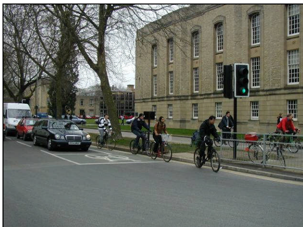
Typical ASL installation, Oxford

ASLs should extend across all the traffic lanes. Part-width ASLs do exist but they need to be individually authorised as they are not covered by TSRGD. It should be noted that ASLs can only be used at signalised junctions. TSRGD specifically does not authorise their use at signalised cycle and pedestrian crossings i.e. Pelicans, Puffins and Toucans.