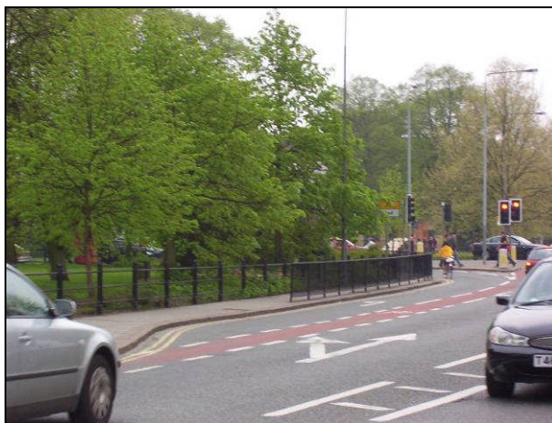
Cycle lane on the off side of a filter lane, Cambridge

In determining the best solution the designer needs to consider how difficult it is for cyclists to position themselves correctly at the reservoir (partly dependent on the width and depth of the ASL) against how difficult it is for cyclists to move from the nearside into a central or off-side cycle lane. In cases where there is localised widening or flaring on the approach to the junction from one lane to two lanes, the best option is sometimes for the advisory lane to move from the nearside to the middle of the two vehicle lanes at the point of widening, so that motorists moving into the left lane have to cross the cycle lane. The cycle lane should have a coloured surface to make it conspicuous (see picture below).