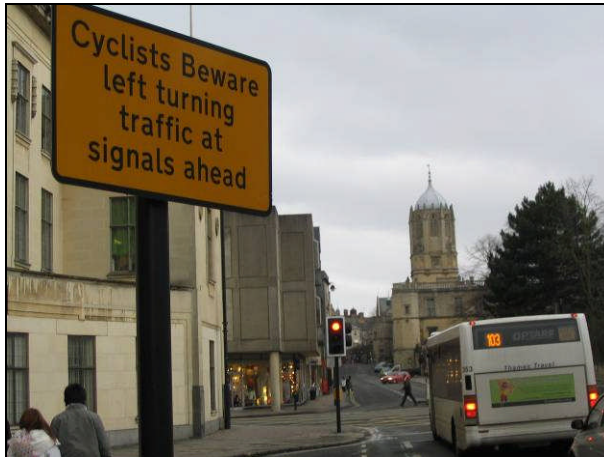
Sign warning cyclists of left turning vehicles, Oxford

Care should also be taken at signals where there are large numbers of HGVs turning left because of the potential for cyclists to move into the driver's blind spot. In some cases warning signs have been posted for both cyclists and lorry drivers. Another potential hazard is where car occupants open the nearside door into the path of a cyclist. Typical locations may be where car drivers drop off passengers, e.g. at rail or coach stations. If there is a high incidence of this, a non-nearside lead-in lane might be the solution.