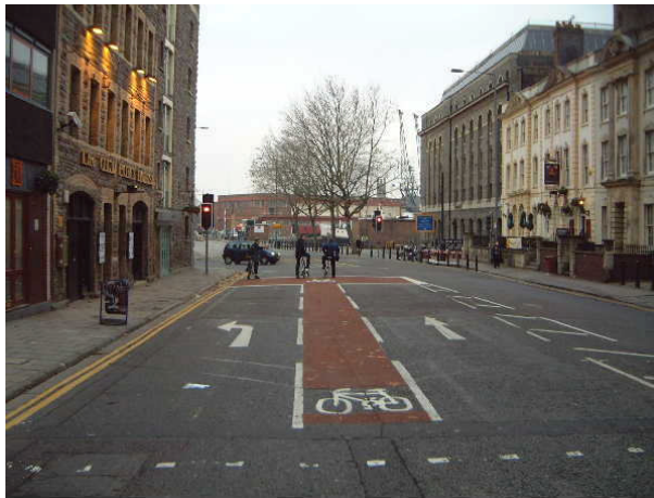
Central lead in lane, Bristol

Designing non-nearside lead-in lanes requires more care because of the way in which they operate. The main benefit of nearside lead-in lanes for cyclists is that they make it easier for them to get ahead of rows of stationary vehicles waiting at signals. Non-nearside lead-in lanes also fulfil this purpose, but more importantly they serve as a means of protecting cyclists in potentially vulnerable situations.